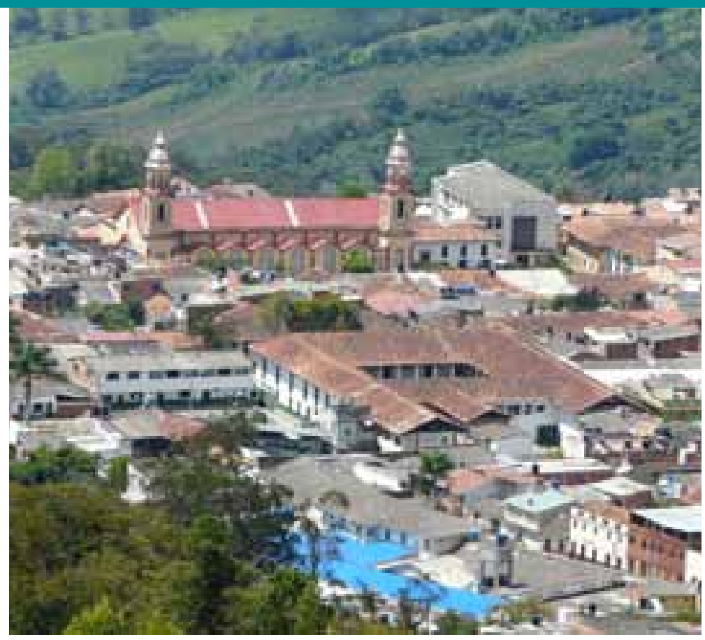
Panoramic view of Vélez