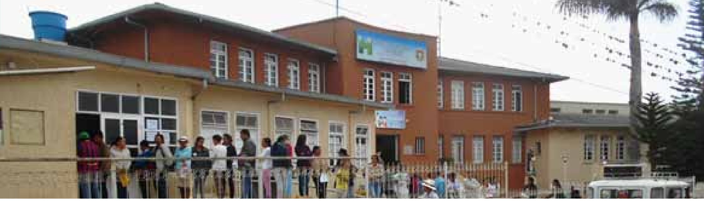
The long wait at the Hospital