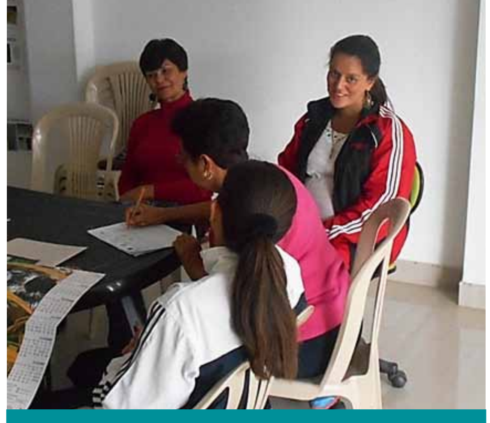
Mesa Urbana at work.

élez is the capital city of the province of the same name, famous throughout Colombia for its guava jelly production and derivatives of other fruits. As head of the province which has 17 municipalities and approximately two hundred thousand inhabitants, it is an important center where several provincial public services have their headquarters. A short distance away is Barbosa, an urban municipality with an accelerated population growth due to its commercial dynamics. In 2010, in Vélez, the construction of a futuristic vision started, where the Civil Society could express its view about the city they wanted for the year 2039, date of the five hundred years anniversary of Vélez. This initiative, promoted by the Development Corporation of the Vélez Province, an NGO supported by Bread for the World, visualized both the dreams and the complaints of the general population. More than 500 different proposals and complaints were presented, provided by 1820 people (about 10% of the municipal population) about various issues, with emphasis on health care, drinking water supply and lack of recreational spaces. To follow up on this vision and help in its implementation, different civil society groups were formed, among them the group "Mesa Urbana" (the City Table)