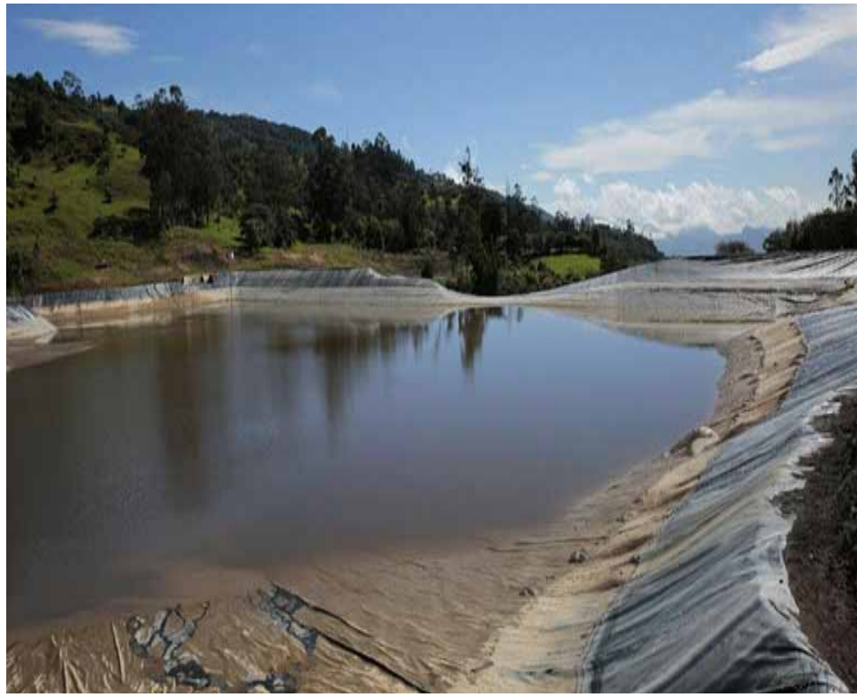
Dam of Vélez

The members, mainly women, feel that they have managed to win some victories even if not the complete battle. Hospital services have improved a little and in the subject of the dam the restart of the work was achieved, without knowing when, one day it will potable water will be available in